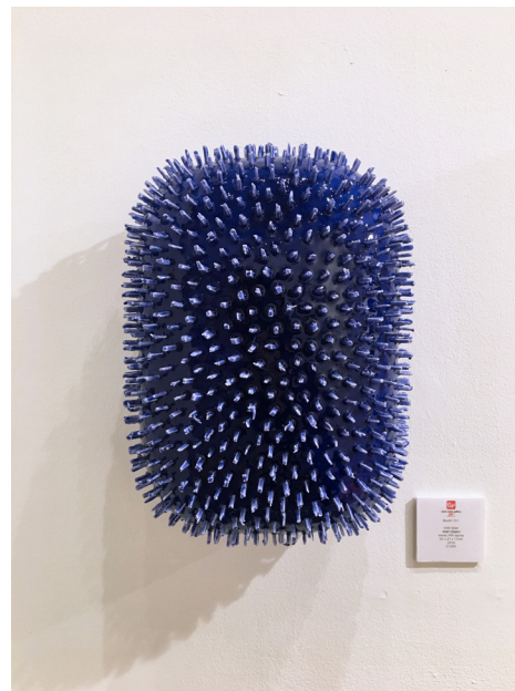
Wall Object wood, PIR, epoxy 木、PIR、環氧 35 x 27 x 17cm 2019 HK$17,000