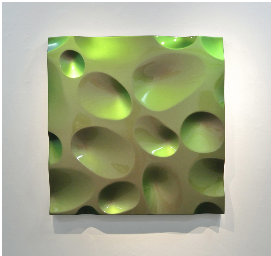
Wall Object MDF, interference varnish 中密度纖維板、清漆 80 x 80 x 6cm 2018 HK$69,000