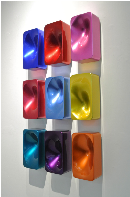
Wall Objects MDF, interference varnish 中密度纖維板、清漆 18 x 10 x 7cm each, 9 pcs 2019 HK$10,000 each