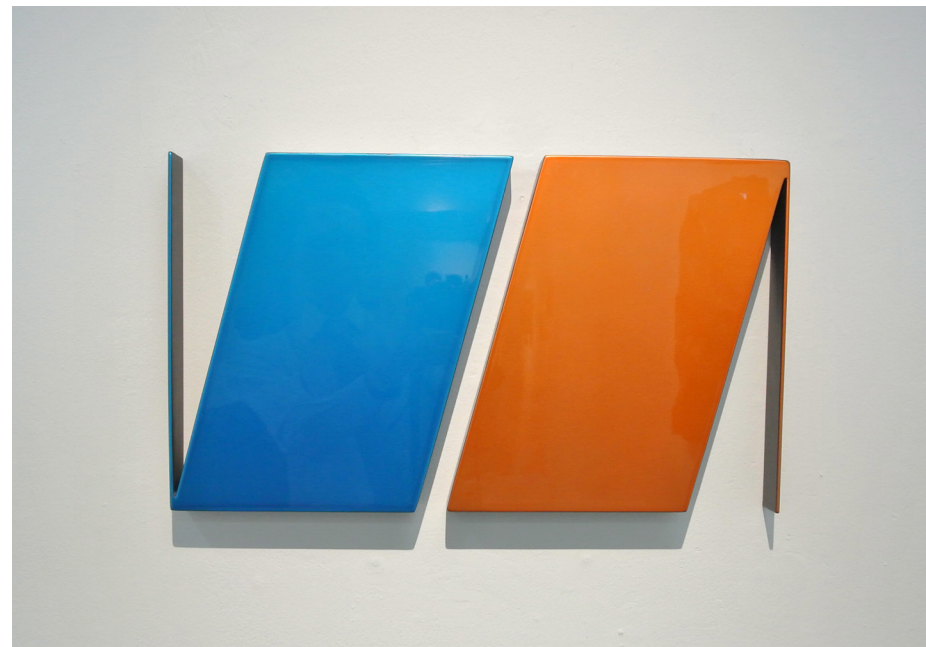
Wall Object metal, chrome varnish 金屬、清漆 30 x 29 x 4.5cm each, set of 2 pcs 2018 HK$33,000