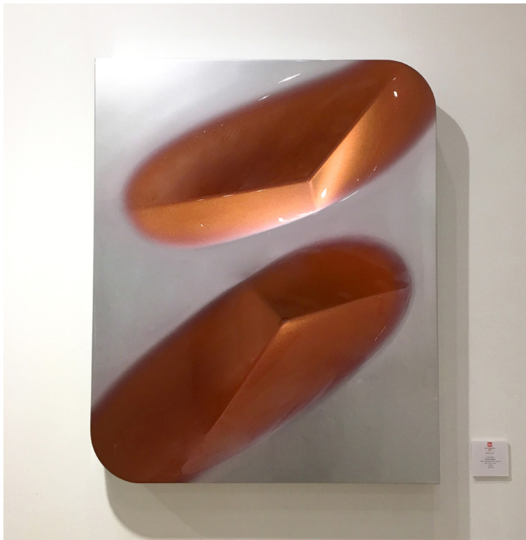
Panel Object MDF, interference varnish 中密度纖維板、清漆 65 x 50 x 7cm 2019 HK$63,000