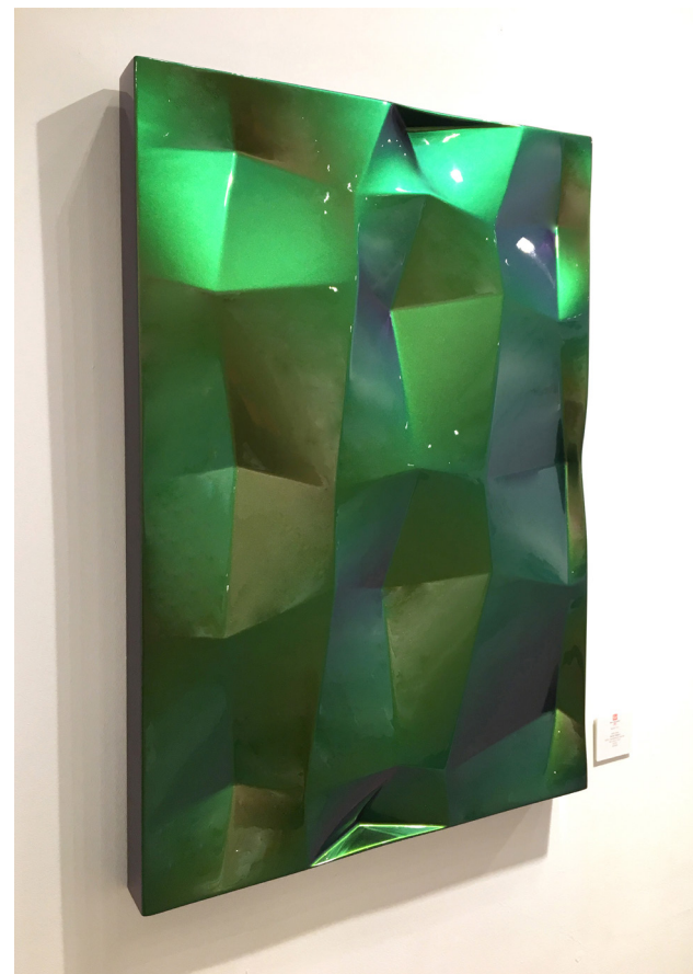
Panel Object MDF, interference varnish 中密度纖維板、清漆 89 x 68 x 7cm 2018 HK$87,000