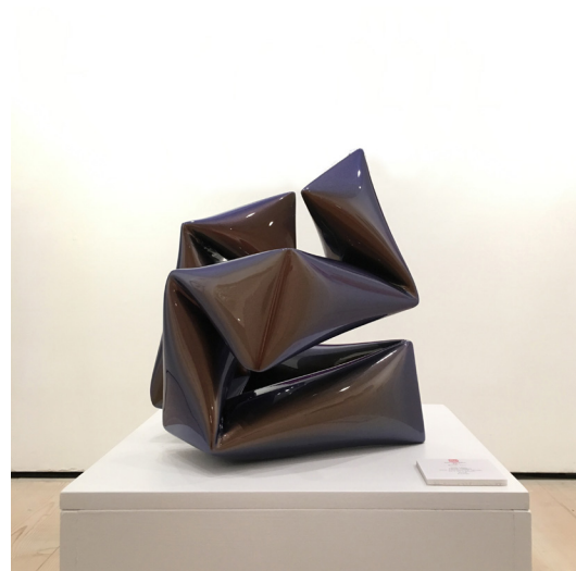
Plinth Object steel, interference varnish 金屬、清漆 34 x 27 x 30cm 2018 HK$75,000