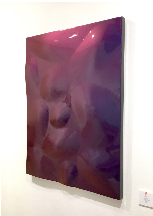
Panel Object MDF, interference varnish 中密度纖維板、清漆 90 x 60 x 7cm 2019 HK$90,000