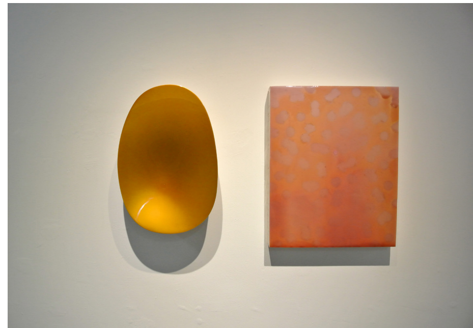
Wall Object multiplex, chrome varnish 膠合板、清漆 35 x 24 x 9.5cm 2018 HK$16,000