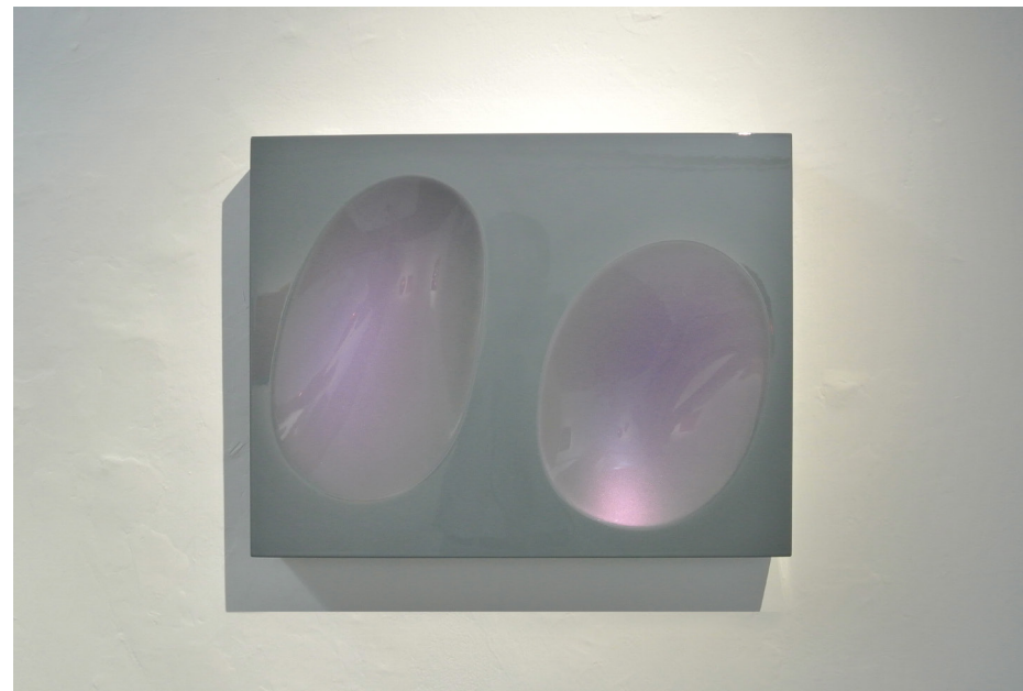
Wall Object MDF, interference varnish 中密度纖維板、清漆 40 x 50 x 6cm 2019 HK$28,000