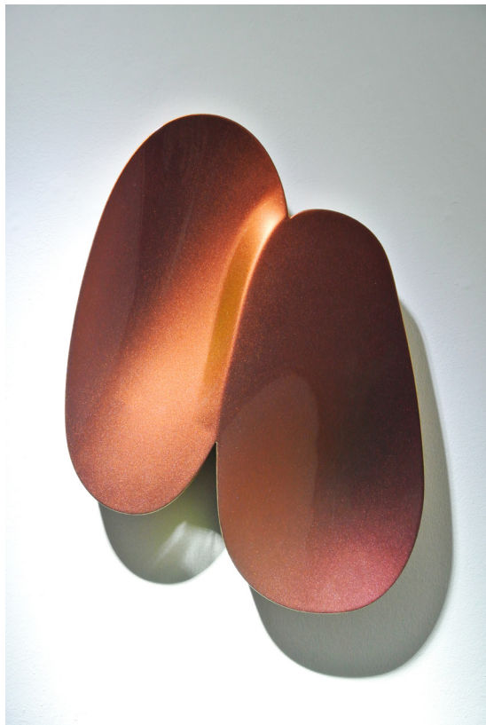
Wall Object MDF, interference varnish 中密度纖維板、清漆 60 x 43 x 6cm 2019 HK$57,000