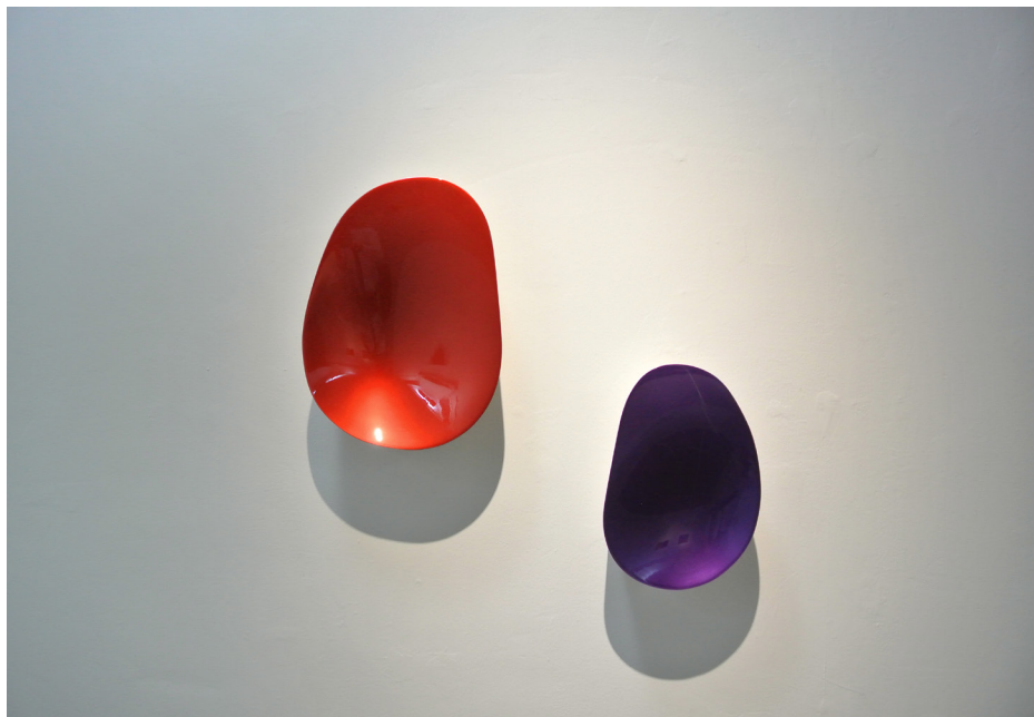
Wall Object multiplex, chrome varnish 膠合板、清漆 28.5 x 21 x 9.5cm 2018 HK$15,000