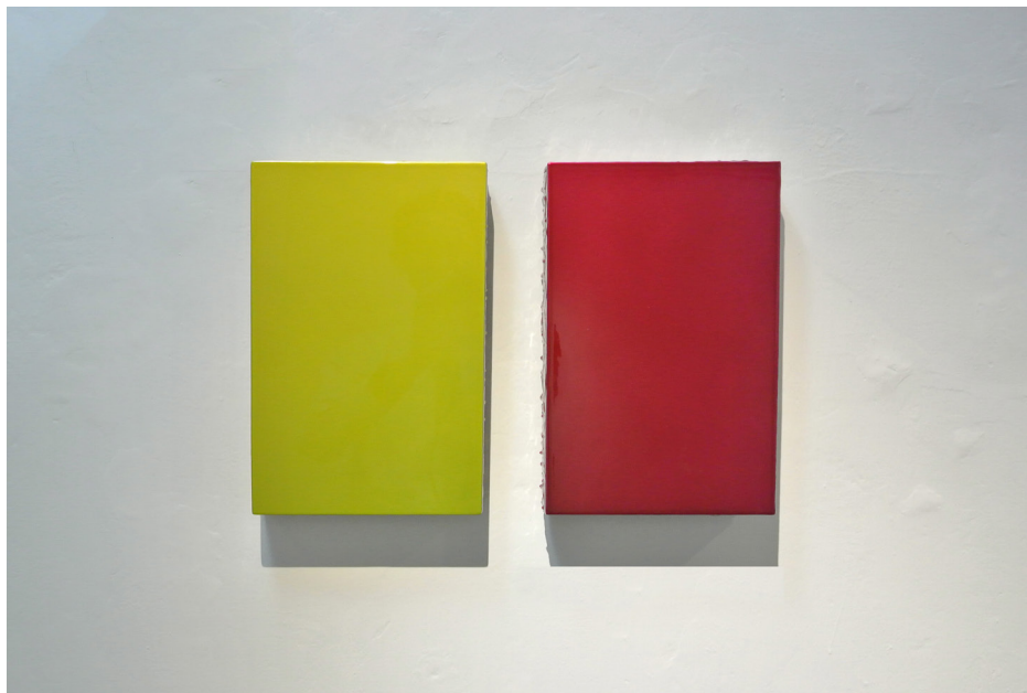
Wall Objects metal, interference varnish 金屬、清漆 30 x 20 x 5cm each, 2 pcs 2018 HK$14,000 each