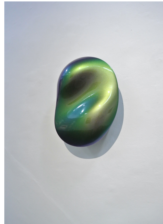
Wall Object MDF, chrome varnish 中密度纖維板、清漆 30 x 24 x 10cm 2019 HK$22,000