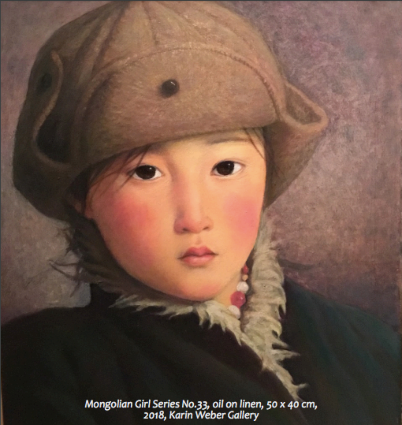
Mongolian Girl Series No.33, oil on linen, 50 x 40 cm, 2018, Karin Weber Gallery