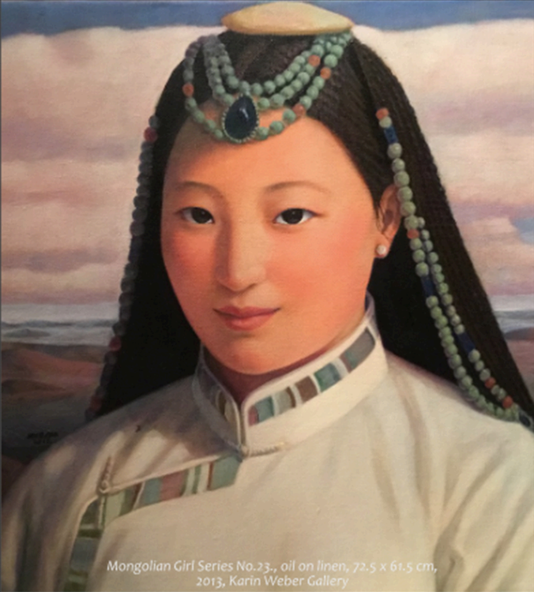
Mongolian Girl Series No.23., oil on linen, 72.5 x 61.5 cm, 2013, Karin Weber Gallery