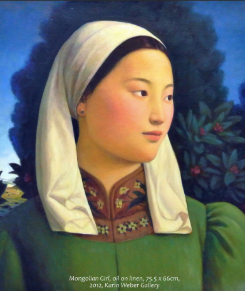
Mongolian Girl, oil on linen, 75.5 x 66cm, 2012, Karin Weber Gallery