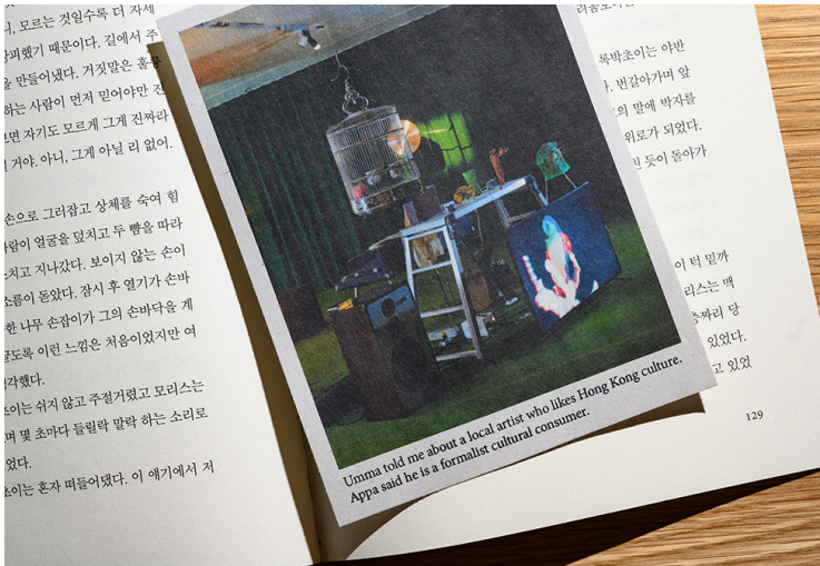
An Except of My Journal 日誌錄 artist's book 書 22 x 16 x 1.5cm 2020