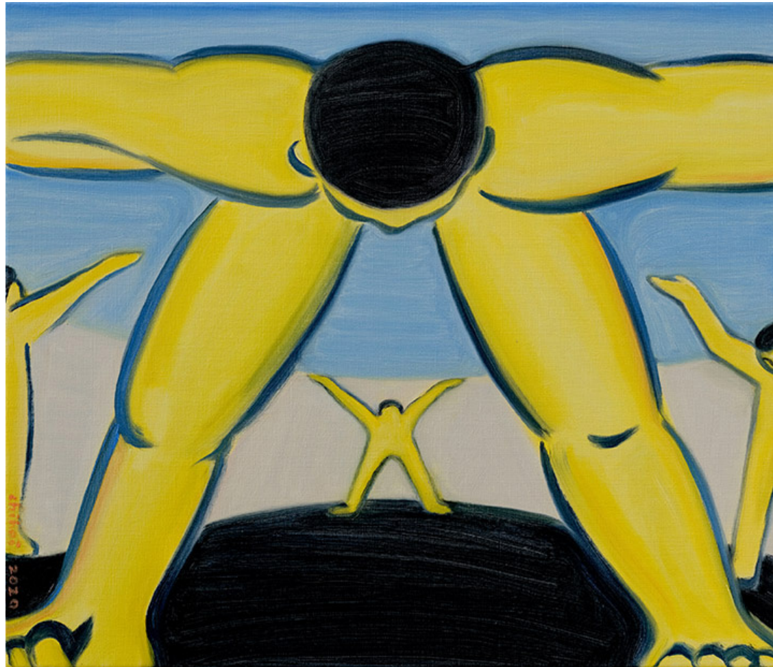
Trinity With Heaven And Earth I 與天地參 (一)