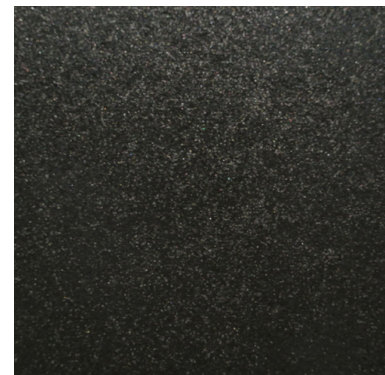
close-up detail 特寫細節