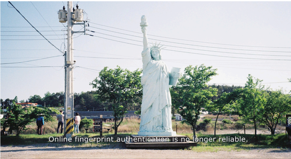
A Message To The Past 給過去回訊 digital video 數碼影片 9m20s 5 editions +1AP 2020