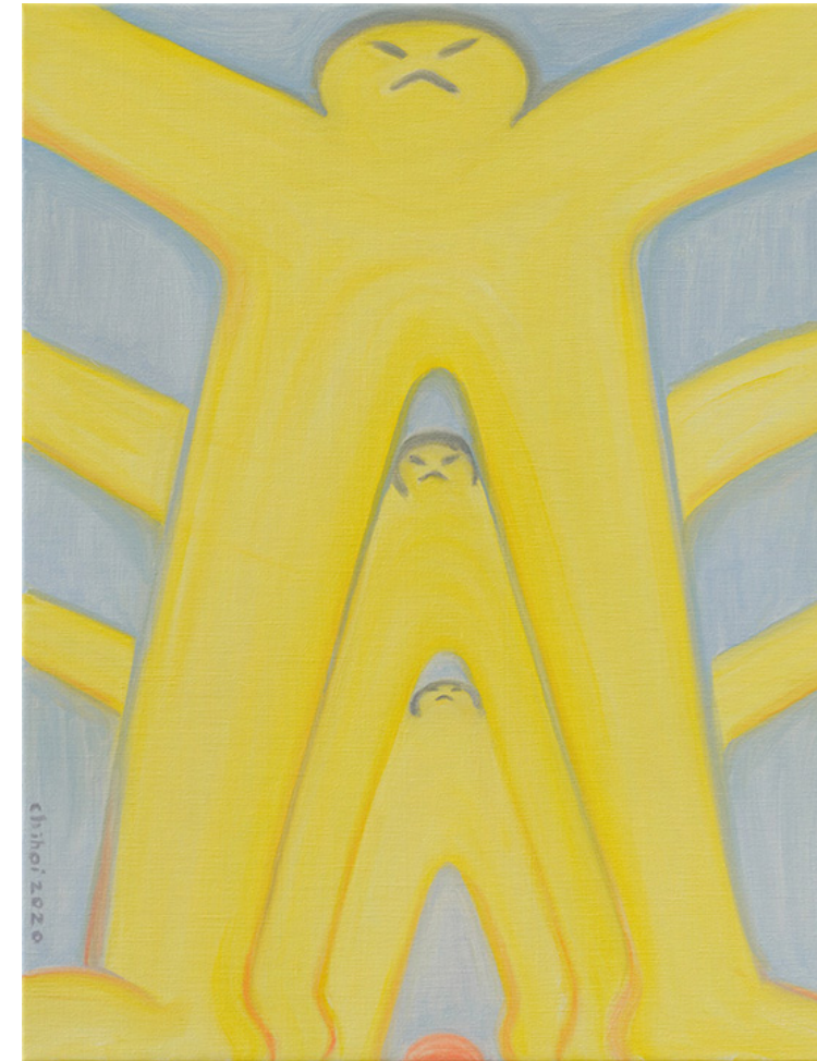
Trinity With Heaven And Earth II 與天地參 (二)