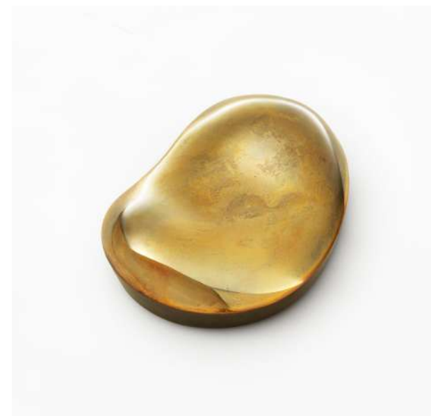
Wall Object 掛牆物件 polished bronze 27 x 21 x 7cm 2020