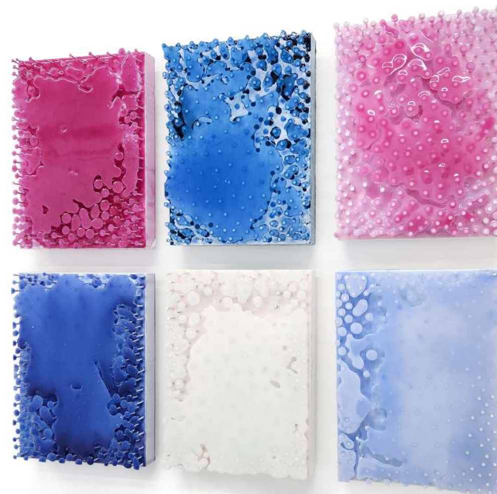
Wall Objects 掛牆物件 metal, PIR, epoxy 29 x 21.5 x 7cm each 2022