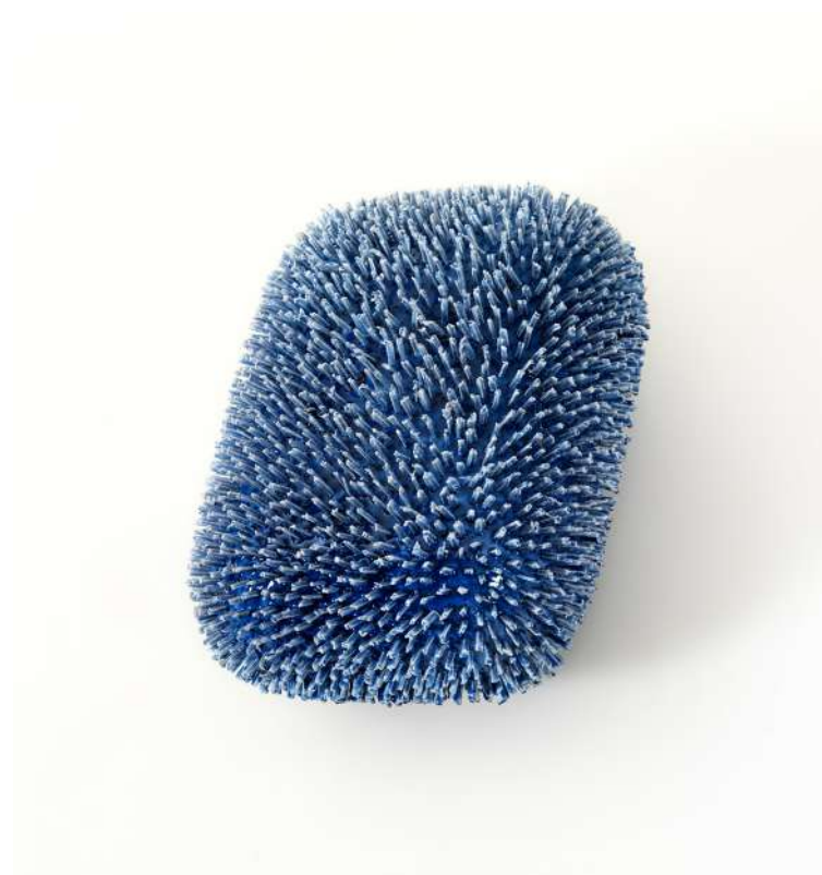
Wall Object 掛牆物件 wood, PIR, epoxy 33 x 25 x 17cm 2023