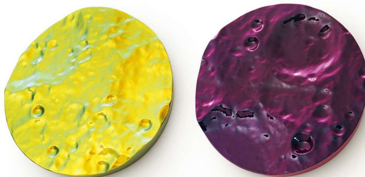
Wall Objects 掛牆物件 birch, MDF, chrome varnish 35 x 35 x 4.5cm each 2022