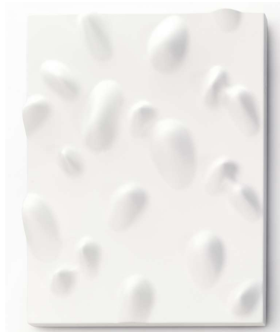
Panel Object 嵌板物件 MDF, polished varnish 80 x 56 x 9cm 2023