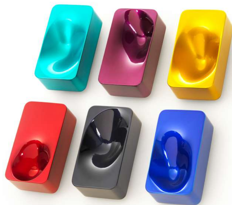
Wall Objects 掛牆物件 MDF, chrome varnish 18 x 10 x 7cm each 2015-2020