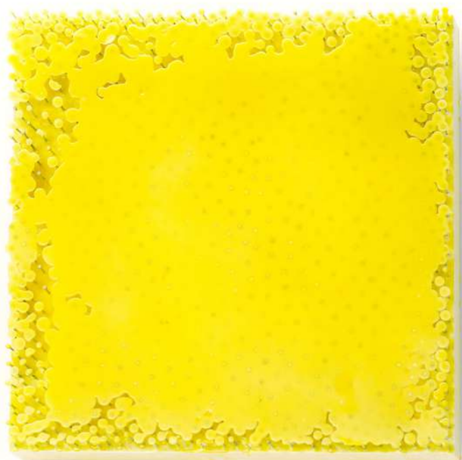
Panel Object 嵌板物件 metal, PIR, epoxy 56 x 56 x 7cm 2023