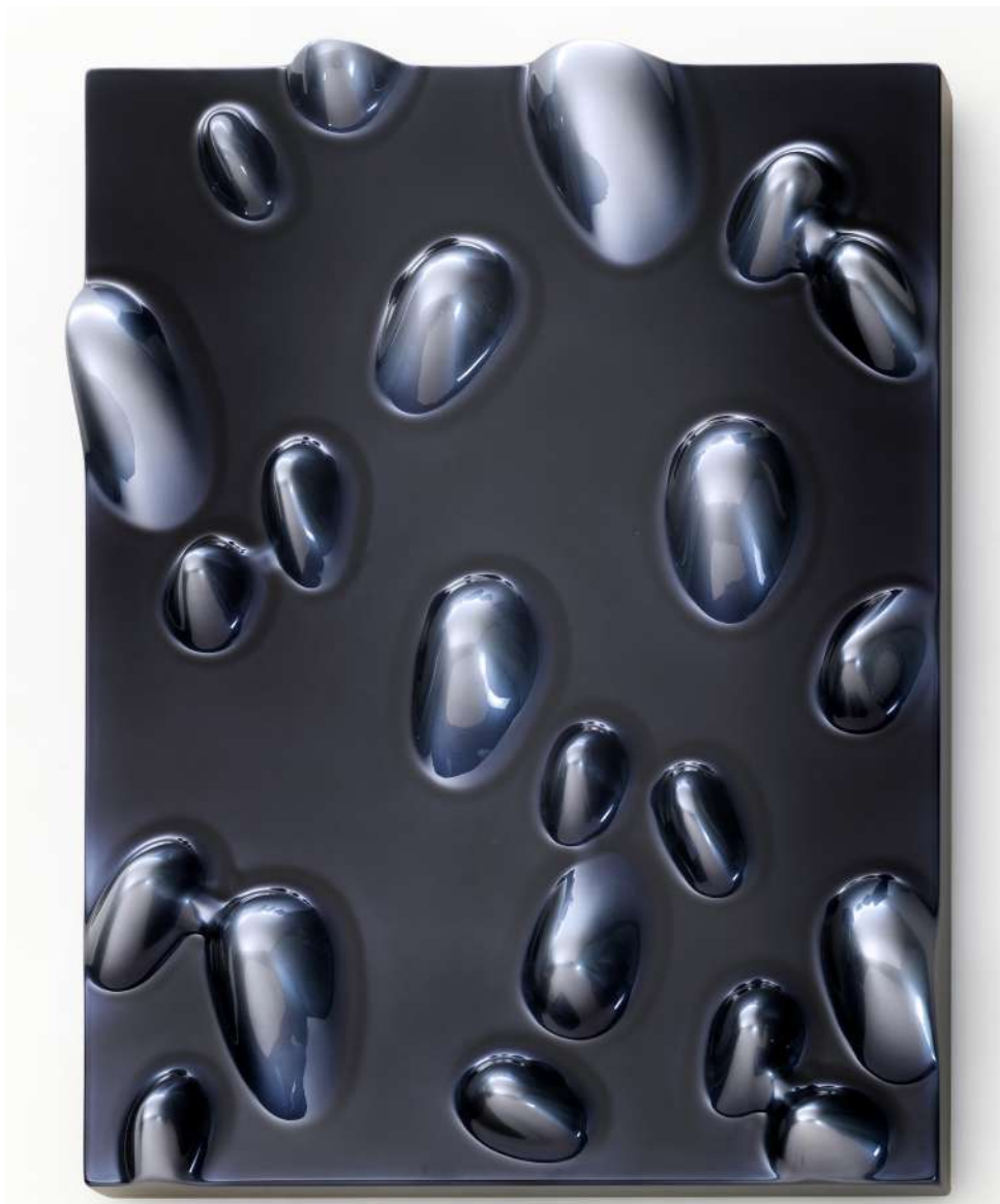
Panel Object 嵌板物件 MDF, chrome varnish 80 x 56 x 9cm 2023